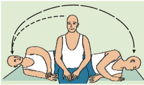
Fig. 2 Semont releasing maneuver towards the left for the treatment of right posterior canal cupulolithiasis. 26

30–60 seconds, and then the patient is asked to place their chin on their chest and to sit slowly. The head remains low for a moment before returning to the normal position. The sequence of movements can be seen in Fig. 1. The Semont maneuver is indicated for the treatment of cupulolithiasis of the vertical canal. When the posterior canals are involved, the patient is initially seated with the legs hanging and then moved to the lateral decubitus position of the affected side, with the head forming a 45° angle with the stretcher. Nystagmus and/or vertigo occur, and the position is maintained for 1–3 min. The examiner holds the patient's head and neck, moving it quickly toward the other side of the stretcher. From the beginning to the end of the trajectory, the head is kept in the same position until it reaches the opposite side, when the patient touches the stretcher with their forehead and the nose (Fig. 2). In the case of the superior canals, the movement is performed in the opposite direction to that used for the maneuver of the posterior canals.